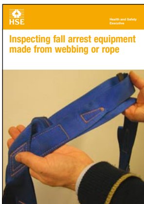
This is a web-friendly version of leaflet INDG367