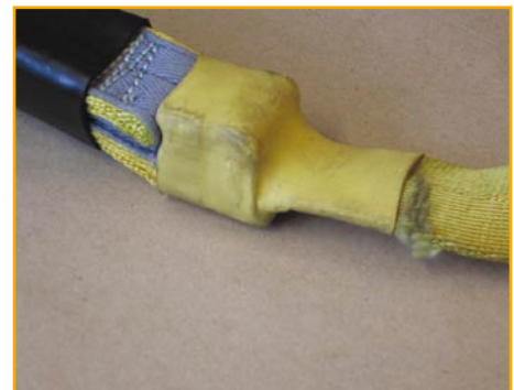
Figure 2 Abrasion damage adjacent to energy absorber: displaced protective sleeve over energy absorber