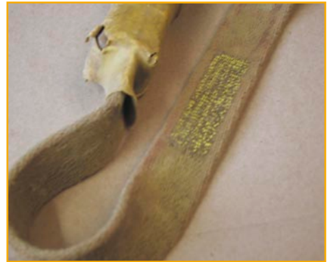
Figure 8 Missing label: damage to protective sleeve over energy absorber