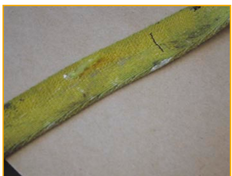
Figure 4 Surface fibres damaged by abrasion