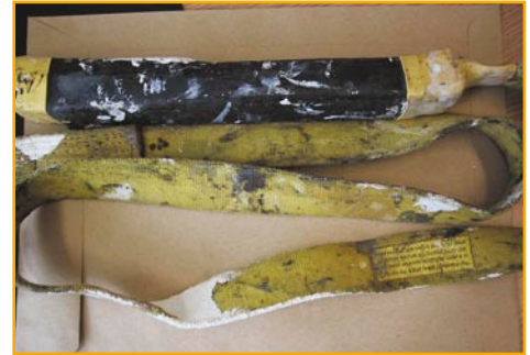
Figure 6 Heavy paint contamination to webbing