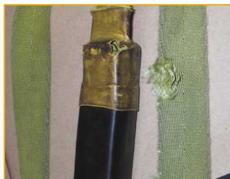
Figure 1 Damaged webbing and protector to energy absorber

The following photographs show lanyards that have been withdrawn because of damage suffered during use.