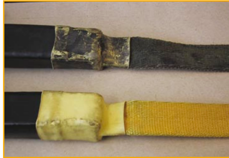
Figure 5 Two similar products with unknown history – the top webbing is heavily soiled