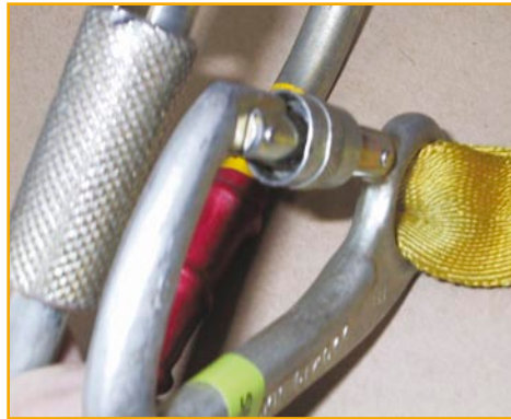
Figure 7 Damaged gate on karabiner